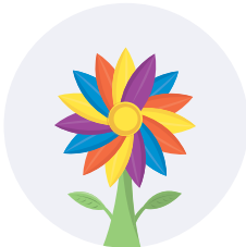
Pediatric End-Of-Life Care