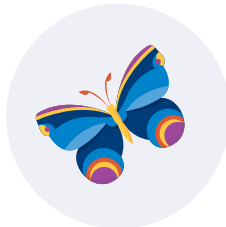
Grief & Bereavement Support