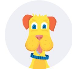
Life-Enhancing Therapeutic Activities