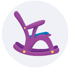
Pediatric Respite Care

Our services are provided at no cost to families thanks to the generous donations and support from our community and beyond.